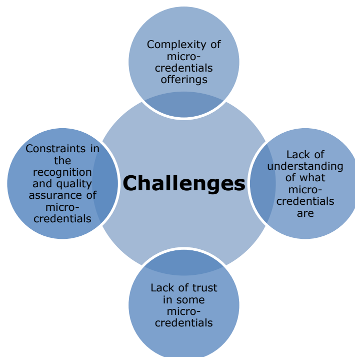
Figure 1. Challenges to scaling up the use of micro-credentials

None of the barriers mentioned above is insurmountable, and they can all be overcome if European educators and policy makers adopt a coherent and consistent approach to micro-credentials.